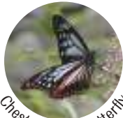
Chestnut tiger butterfly