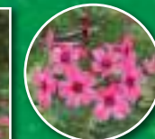
Kurinso (Japanese primrose): A popular wildflower with large, beautiful blooms.