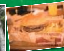
Juicy hamburgers are the signature dish of this store!